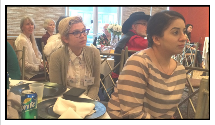
We had a full house at Mezban Restaurant, It was great to see opticians in Houston and its surrounding areas to continue to make themselves better opticians, who can serve society at a professional level. Thank You COAT members for attending.